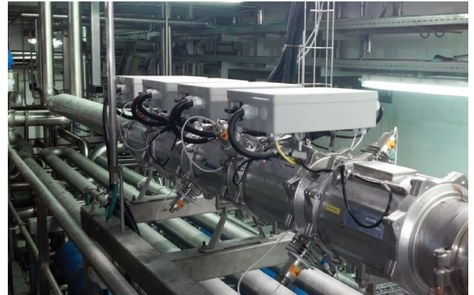
Two parallel Atlantium units treat 85 m 3 /hr of RO permeate